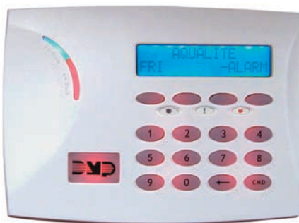
Red Backlighting for Alarm Conditions

In a normal state, both the keypad and logo backlighting remain Blue . However, during an alarm state, the keypad and logo turn Red . The change in color allows persons on-site to instantly recognize an alarm condition.