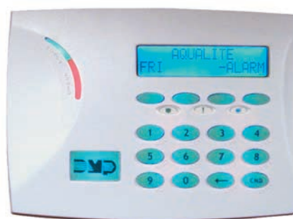
Blue Backlighting for Normal State